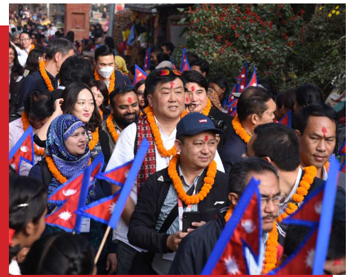
Heritage walk of Bungamati City, Lalitpur