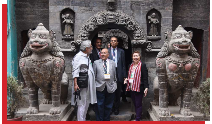
(Nakabahal - Nyakha Chuka - Nag Bahal - Golden Temple - Newa Chhen - Swatha Square – Patan Durbar Square ) Before the inaugural session, the foreign delegates participated in 'heritage walk' from Patan Dhoka to Patan Durbar Square, where a troupe of artists performed cultural procession and dances.