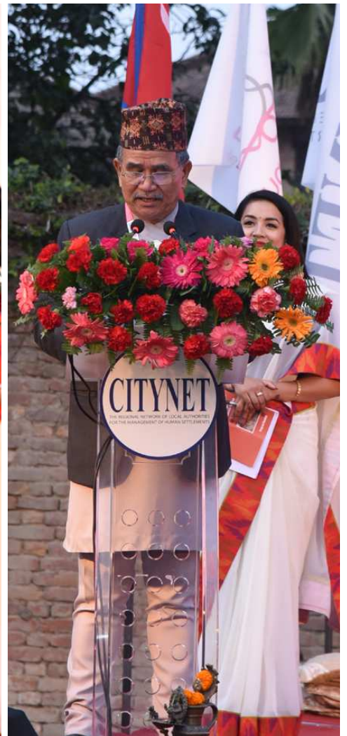
Mayor of Lalitpur Metropolitan City Mr. Chiri Babu Maharjan welcoming the guests