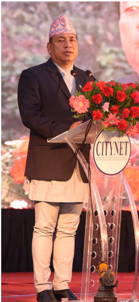
Address by the Chief Guest Rt. Hon'ble Mr. Nanda Bahadur Pun, Vice President of Nepal