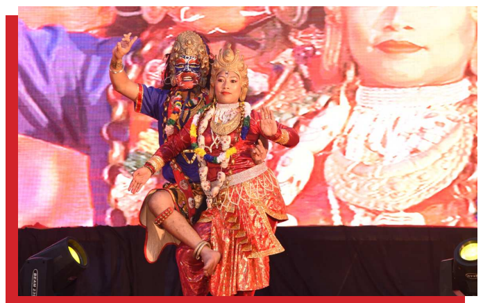
The inaugural session was followed by cultural dances of different tribal groups of Nepal including Bhairav + Kali dance representing Tangible reality and immense power of Goddess Kali.